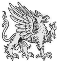
Griffin (part eagle, part lion)