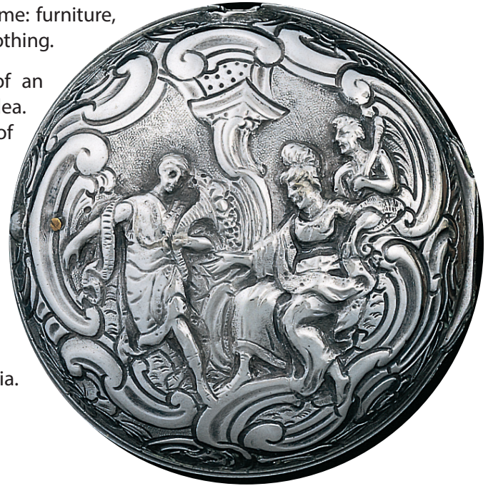
Pair-case Watch, Stoakes, 1750, silver, parcel-gilt, 66.7 x 50.8 x 30.5 mm, Proctor Collection, Frederick T. Proctor Watch Collection, PC. 222

Notice the figure in the center of this scene holding a cornucopia. The figure is an attendant of Ceres, the goddess of the harvest.