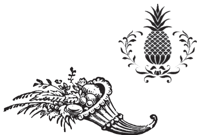
Floral and fruit designs Cornucopia and pineapple

How many of the following designs or motifs can you find on objects in the galleries? Examples are everywhere! Look closely at the carpets, wallpaper, watches, and furniture designs.