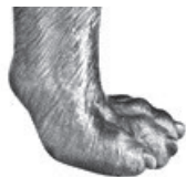
Animal hoof or paw