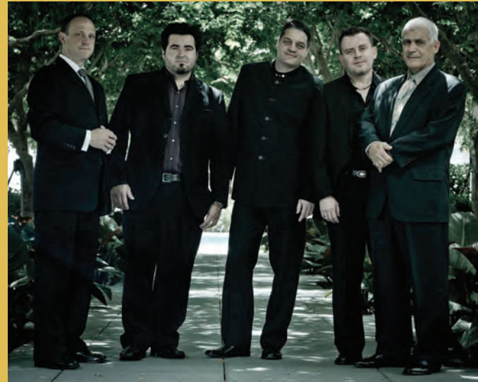
Concerts in the Court Boston Brass