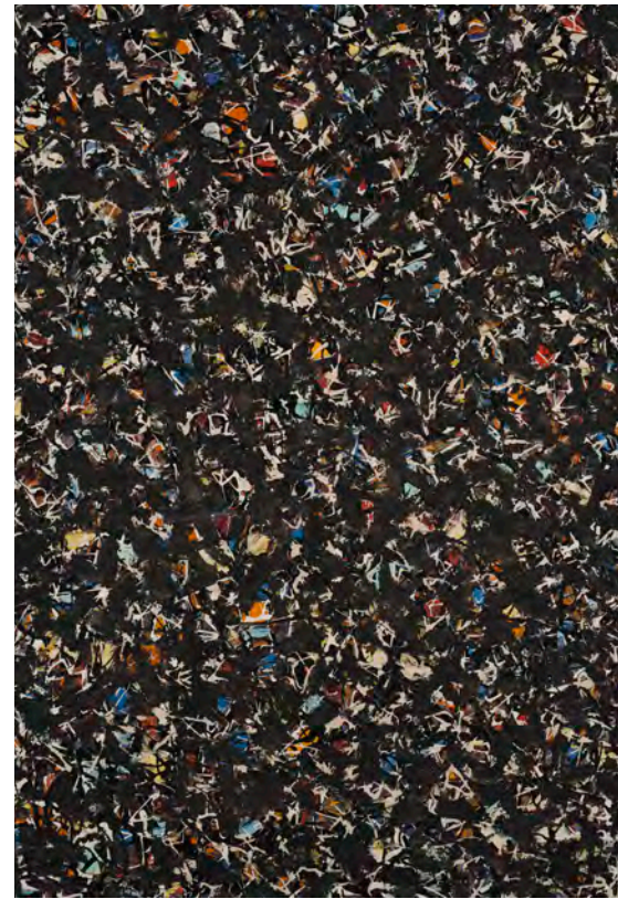
Lee Krasner, American (1908-84), Untitled [Little Image Painting] , 1947-48, oil on canvas, 22 x 16 in., Gift of Clare Eddy Thaw, 2016.2