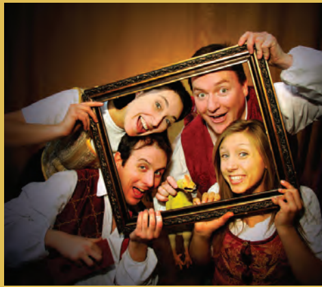
For Kids and Families DuffleBag Theatre Co.